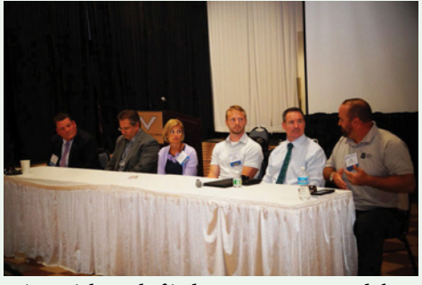
A special panel of industry experts opened the afternoon session discussing a myriad of topics