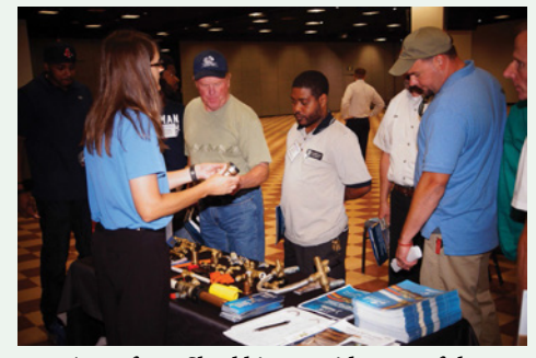
A rep from Sharkbite provides one of the numerous hands-on product demonstrations for members of both organizations